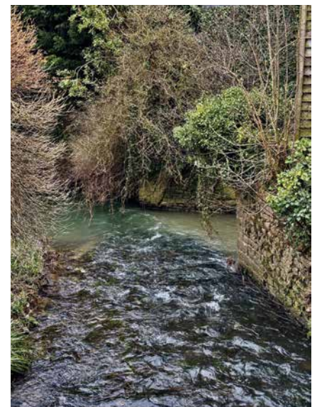
Where the Simene joins the River Brit

Trainees entering data using waterproof clipboards